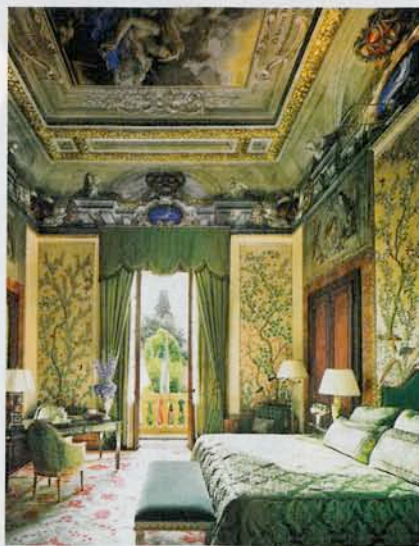
YES, THERE'S WI-FI THE FOUR SEASONS IN FLORENCE IS SET IN A FORMER CONVENT AND PALAZZO.

Rates: From $350. This former Baroque palace is close to major busi-