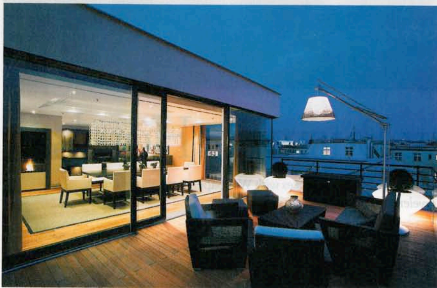
CZECH, PLEASE THE PRESIDENTIAL SUITE AT THE KEMPINSKI IN PRAGUE HAS A PRIVATE TERRACE WITH A HOT TUB.

Rates: From $423. Sitting on the European bank of the Bosphorus, the hotel has elaborate Turkish baths and views from every room. There's also a pool overlooking the sea. fourseasons.com/bosphorus